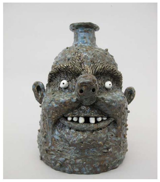
Rutile Jug, 2014 Terracotta.9h x 7w x 8d in. 22.86h x 17.78w x 20.32d cm RM027-cer.