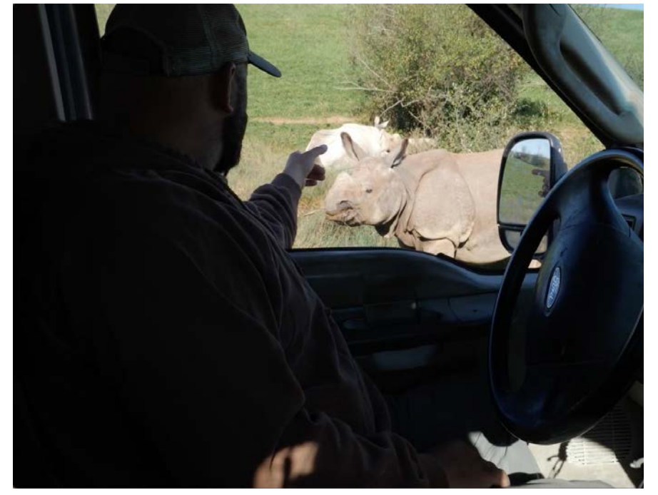
Coal Miner's Son from 10,000 Acres project, video excerpt, 3min

Storytelling, Wildlife, environment, animals, Ohio history