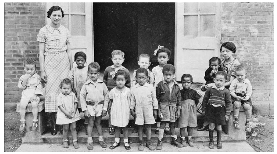
Southeast Ohio Project, video, 23mins courtesy of Black in Appalachia

Black history, religion, education, American history.