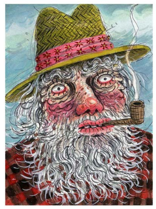
OG Grizzled Man. 2016 Ink and watercolor on paper 5.50h x 3.50w in, 13.97h x 8.89w cm