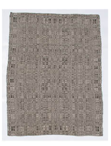
Resiliency (Part I of II): Linum usitatissimum 2016.47" x 45" Natural and deconstructed linen

Resiliency (Part II of II): Linum usitatissimum 2018.55" x 41" Natural and deconstructed linen