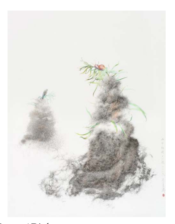
Mountaineers' Dialogues #11 Graphite & colored pencil on paper, 28" x 38", 2019 courtesy of the artist

place, hair, environment, nature, people and places, geography, cultural heterogeneity, communication