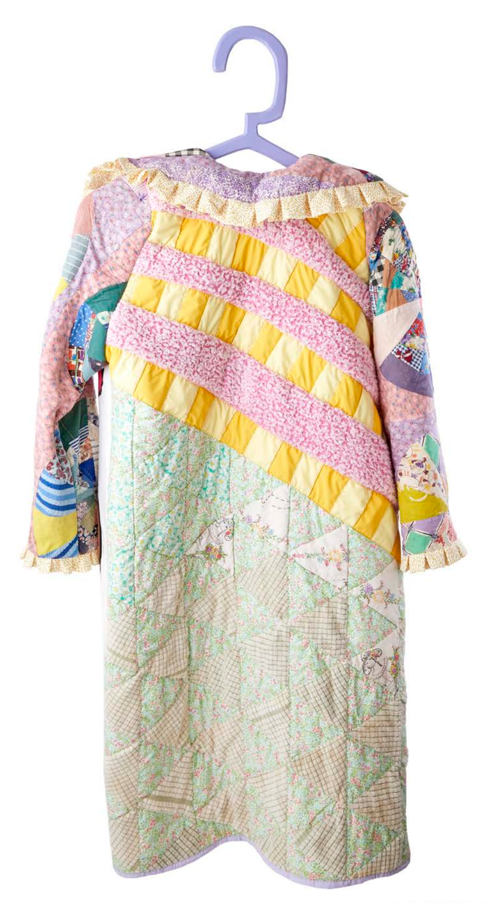
Covers: Natalie Baxter, Housecoat IV, 2021, found quilts, laundry bag, dish towels, graphic t-shirt, hospital receiving blanket, fabric, plastic zipper, cotton batting 60x 32x6 inches.