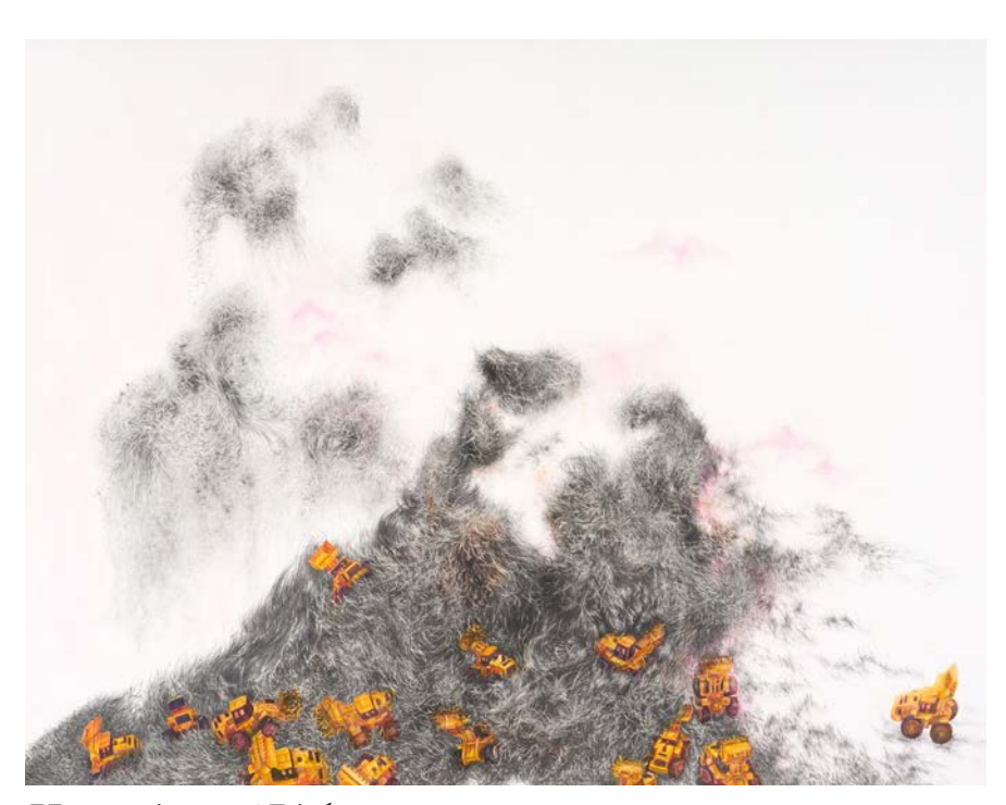
Mountaineers' Dialogues #3 Pencil & colored pencil on paper, 28" x 38", 2017