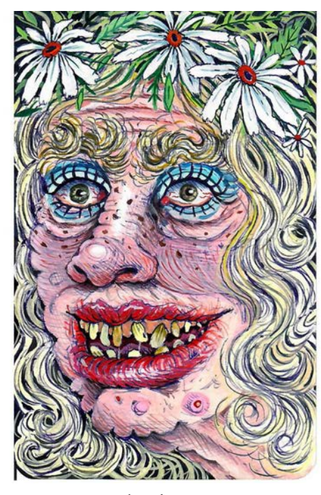
Happy Hippy Woman with Flower Crown, 2017 Ink and watercolor on paper 5.50h x 3.50w in, 13.97h x 8.89w cm courtesy of the artist and and Asya Geisberg Gallery