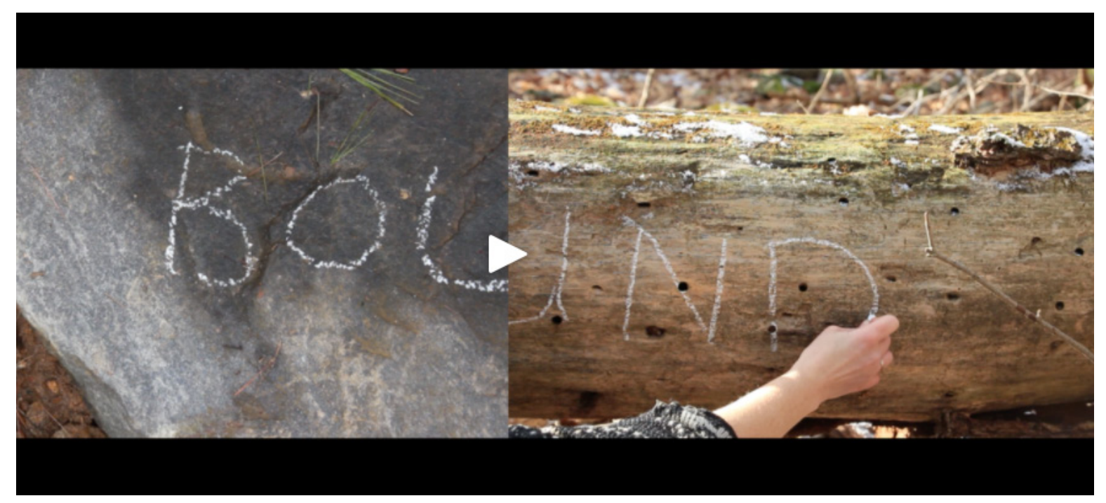
Bound video, 17:21 mins

Poetry, place, distance/closeness, isolation/intimacy, nature, landscape, dialogue, Covid pandemic